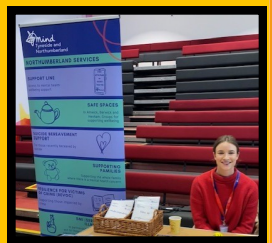
Northumberland and Tyneside Mind

Looking for support but not sure where to turn?