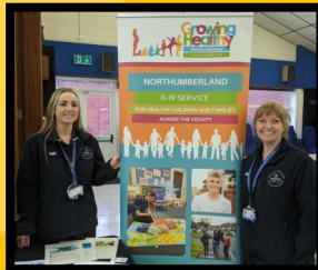
Harrogate & District Foundation NHS Trust Growing Healthy 0-19 Northumberland Service