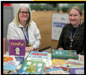
Northumberland Emotional Wellbeing Service

Be You are Northumberland's Mental Health Support Team. Currently, we work in Hexham, Blyth, Ashington & Bedlington areas and have now begun to work within Alnwick and Coquet. We are working hard to expand our reach to more and more areas of Northumberland. Don't worry if we aren't in your area yet, there is still lots of support that can be accessed.