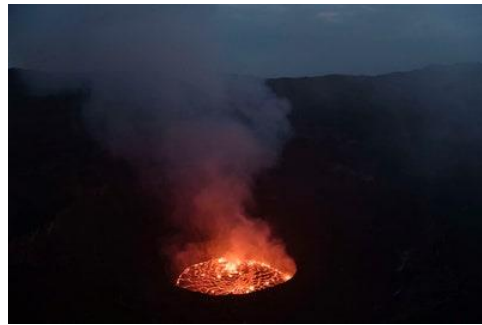
Mount Nyiragongo, Congo (Largest lava lake in the world)