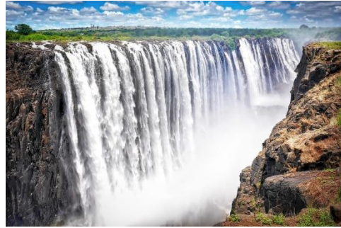
Victoria Falls, Zambia