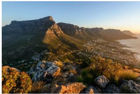
Table Mountain, South Africa