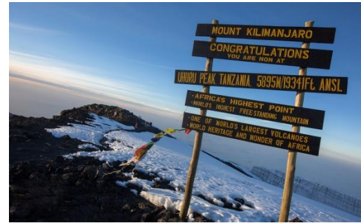
Mt Kilimanjaro, Tanzania