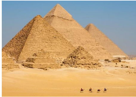
Pyramids of Giza, Egypt