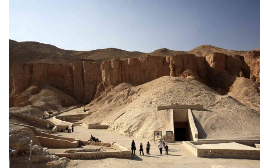
Valley of the Kings, Egypt