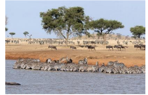
Serengeti National Park, Tanzania