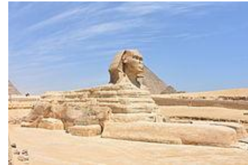
Sphinx, Giza, Egypt