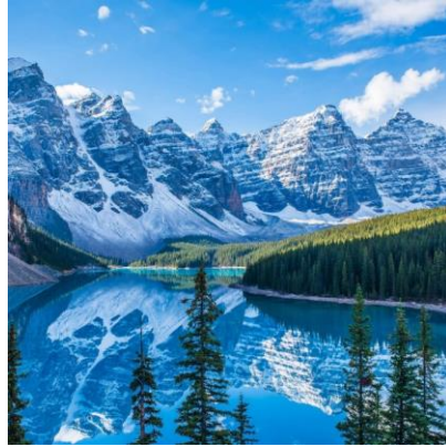
Rocky Mountains stretch from Canada to New Mexico.