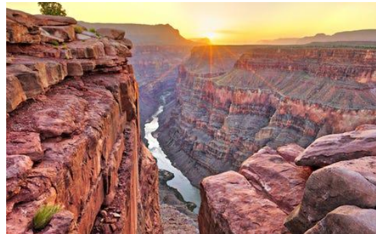
Grand Canyon, Arizona