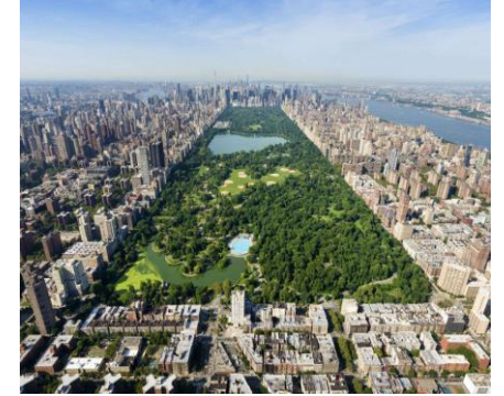
Central Park, New York