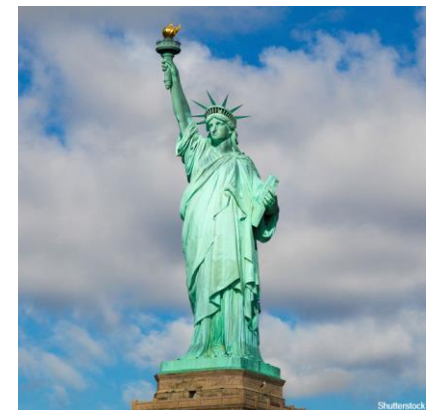
Statue of Liberty, New York