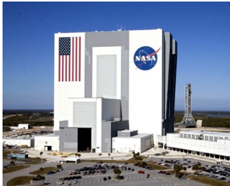
Kennedy Space Center, Florida