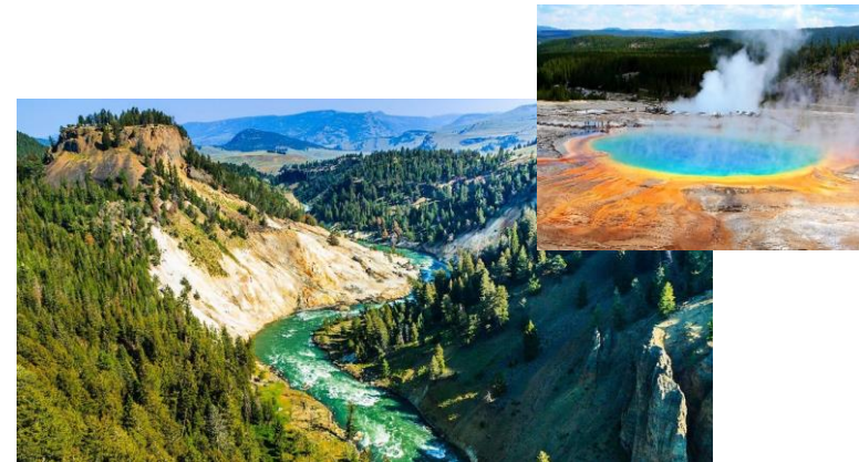
Yellowstone National Park