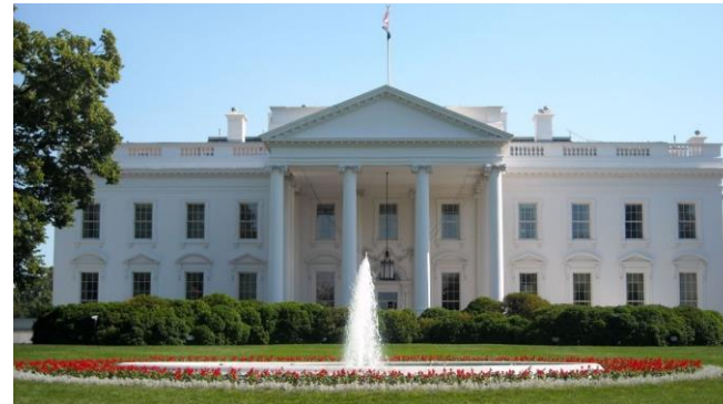
The White House, Washington