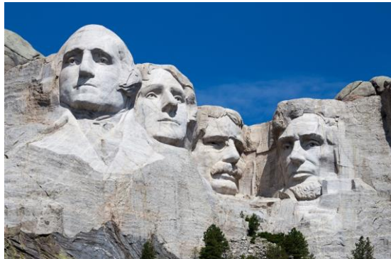
Mount Rushmore, South Dakota