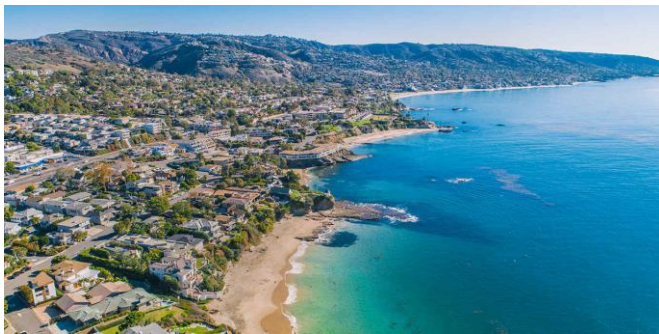
The East Coast has lots of hot sandy beaches.