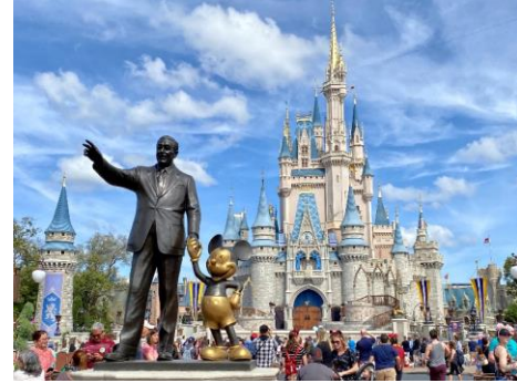
Disney World, Florida, USA