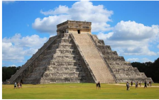
Chichen Itza, Mexico