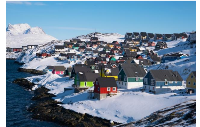
Snow covered town in Greenland.