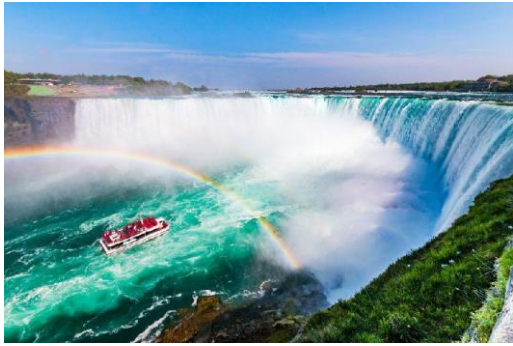
Niagara Falls, Canada