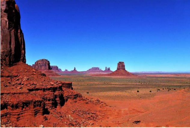
Large areas of USA are desert.