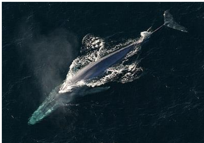
Antarctic Blue Whale