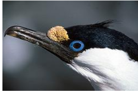
Blue Eyed Shag