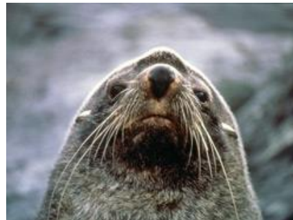
Southern Fur Seal